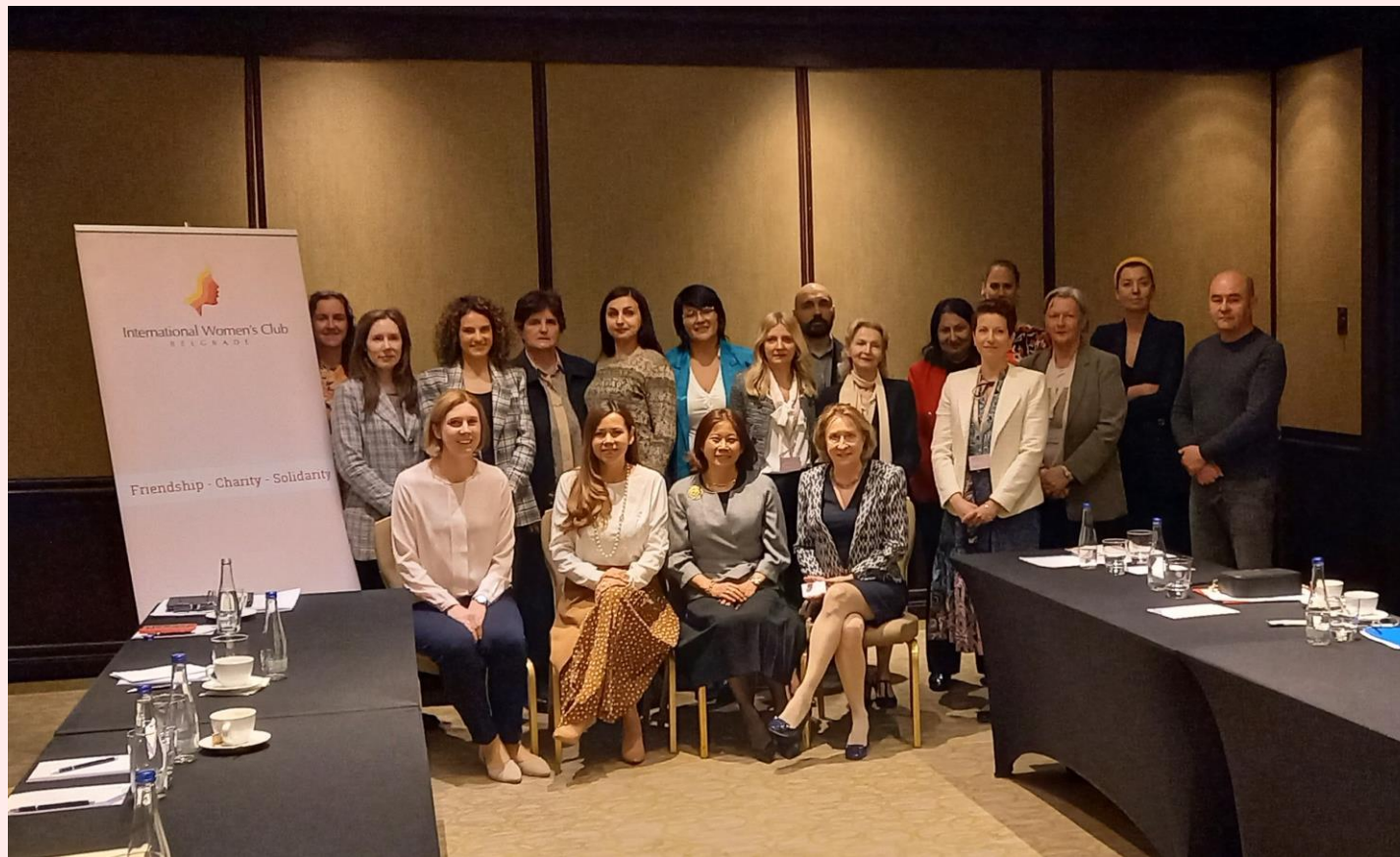
May 4, 2023: Cash Donation Agreements at Hyatt Hotel