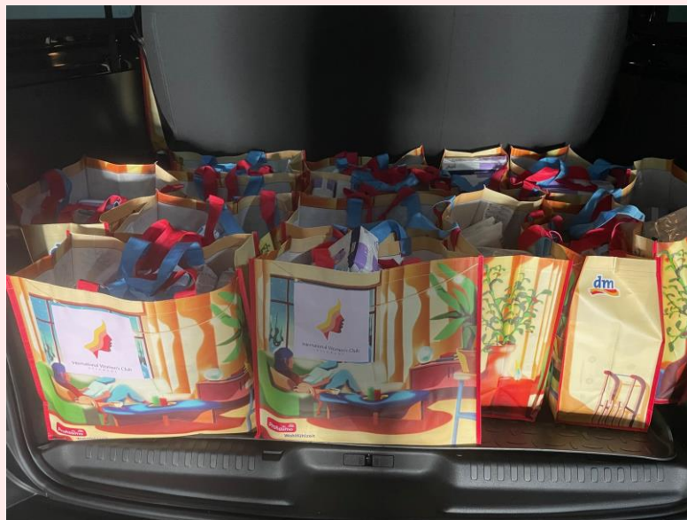
March 21, 2023: BIBIJA Romski ženski centar