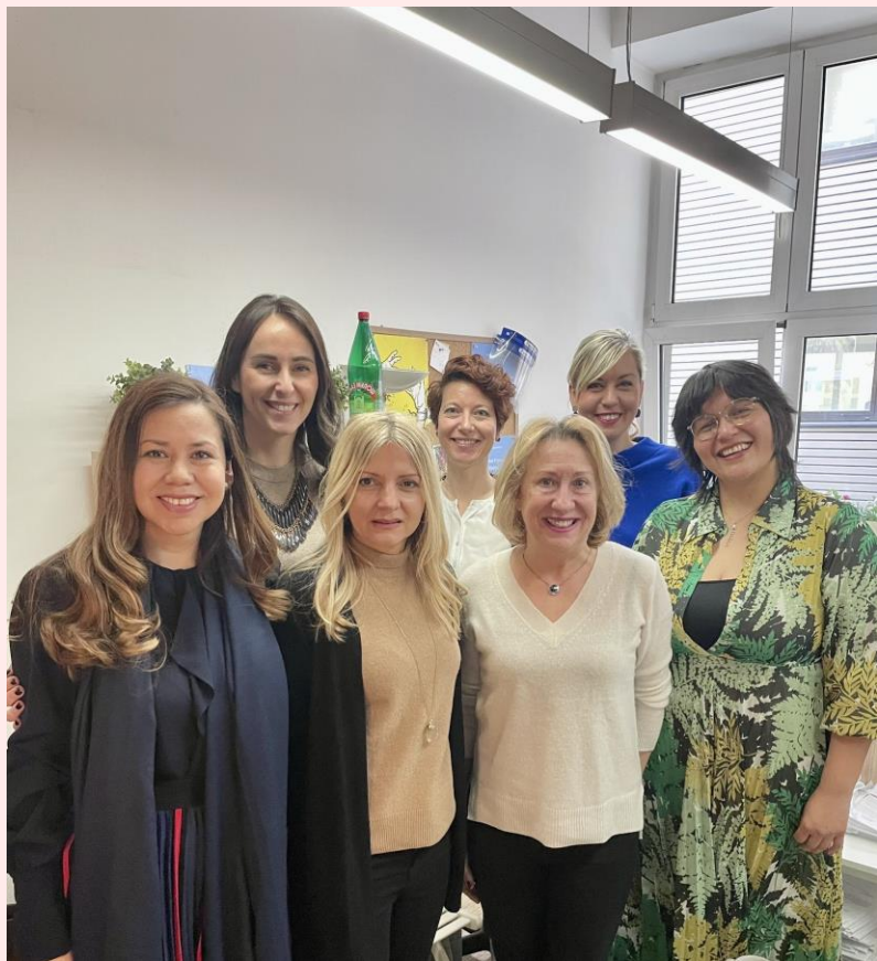
April 5, 2023: Human Rights Center